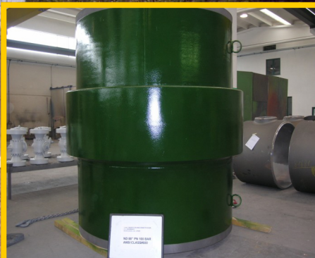
Monolithic Insulating Joints, Flanged Ends