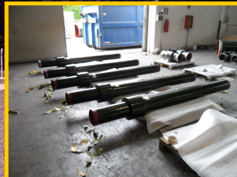
Monolithic Insulating for High Pressure Pipeline (AP10000).