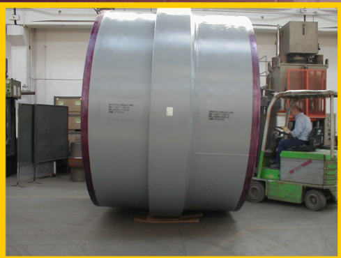
Monolithic Insulating Joints for Water Pipeline N.D. 128" (3251 mm).