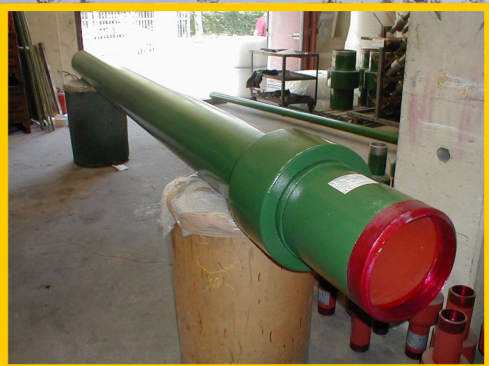
Monolithic Insulating Joints with isolated spool and special sleeves for sea water.