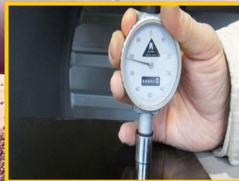
The Strictest Test In The Field