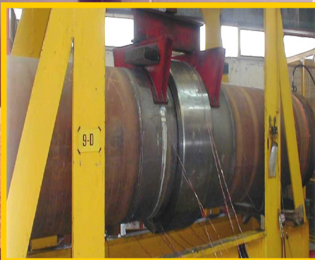
Gas, Oil, And Water Appliances