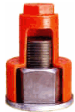
Different heights for larger bolt ends or locking nuts