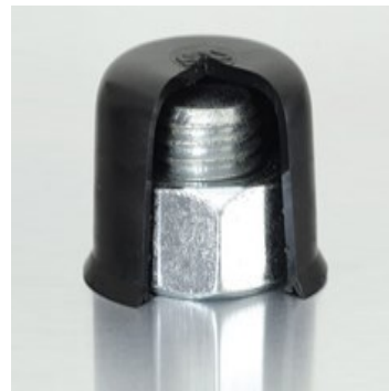
For threaded connections without washer

*Step-Ko's Flange Isolation Gasket kits are manufactured according to the AMPP (NACE) SP0286-2007 Standard to meet customer requirements to fit flange dimensions of ANSI, AWWA, MSS SP-44, B.S. 10, DIN2633, etc.